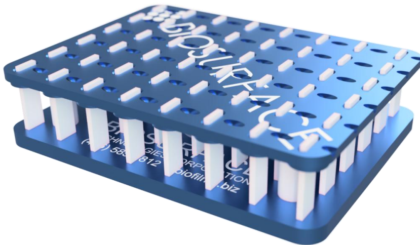
Assembled 48-Well MicroWell™

Designed to facilitate biofilm assays similar to the Calgary Biofilm Device using ASTM E2799* , the MicroWell™ system offers expanded material choices, enabling more comprehensive and diverse biofilm studies. This broad range of applications makes the MicroWell™ Biofilm Plate Assay an essential tool for advancing biofilm research across multiple disciplines.