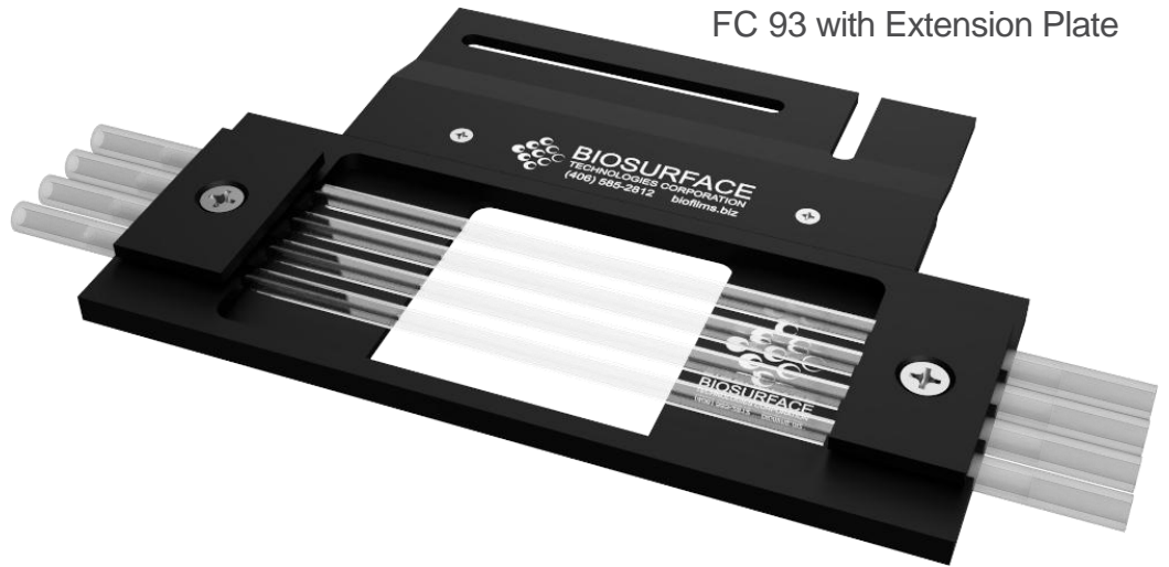
FC 93 with Extension Plate