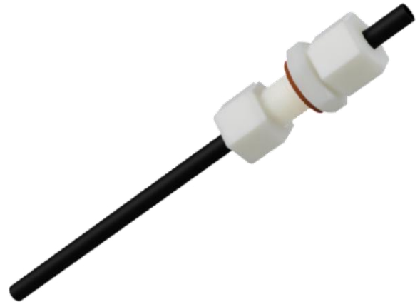
CBR 2218 Temperature Probe Well (includes Bulkhead Fitting and gasket) 316SS - $54.00 , Al - $36.00 , Ny - $32.00