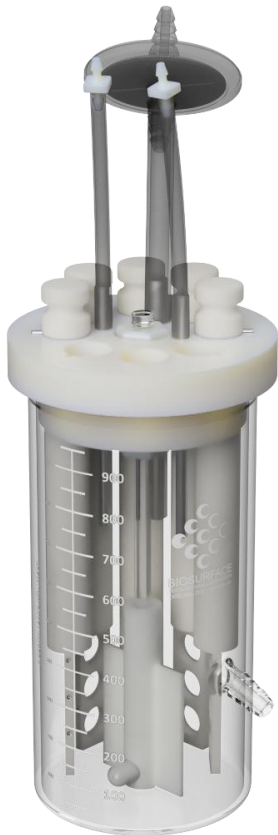
CBR 90 CDC Biofilm Reactor

The CDC Biofilm Reactor® is completely autoclavable and reusable. The total liquid volume is approximately 350 ml. More than forty (40) coupon materials are available, including plastics, metals, and ceramics.