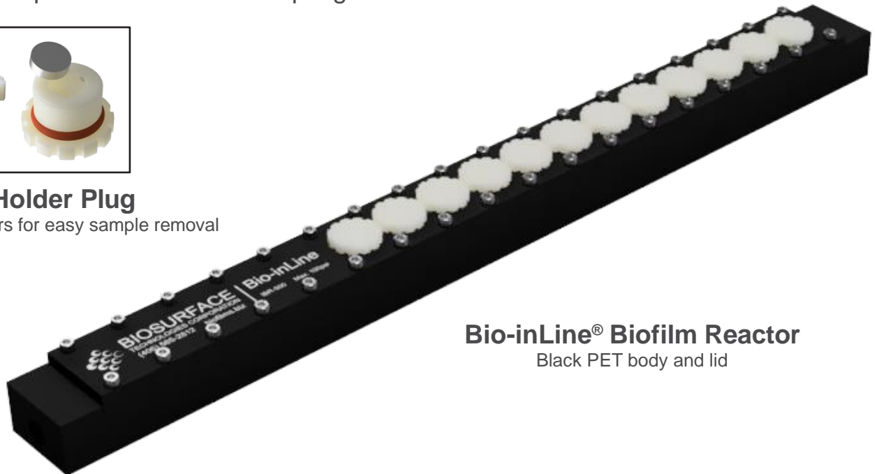
Bio-inLine® Biofilm Reactor

Nylon coupon holders for easy sample removal