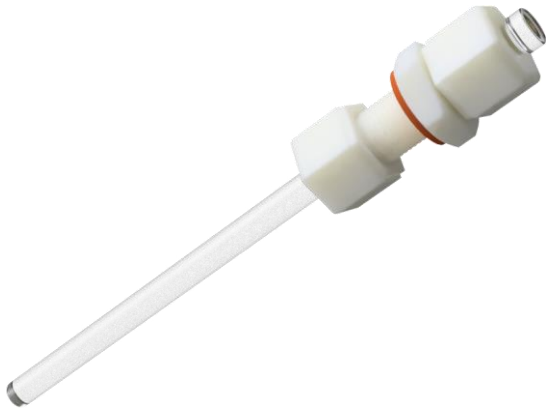
CBR 1969 BF Glass Pivot Rod and Bulkhead fitting with gasket $29.00