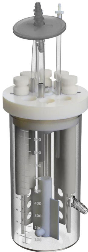
CBR 90 CDC Biofilm Reactor

The CDC Biofilm Reactor® is completely autoclavable and reusable. The total liquid volume is approximately 350 ml. More than forty (40) coupon materials are available, including plastics, metals, and ceramics.