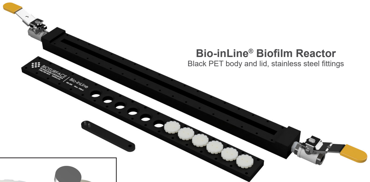
Bio-inLine® Biofilm Reactor Black PET body and lid, stainless steel fittings

The Bio-inLine® Biofilm Reactor was designed to allow the growth and testing of biofilms grown under conditions found in common water distribution systems. They can be easily placed in water piping systems, allowing biofilm testing as needed within the system. This reactor was designed with the original modified Robbins Device (mRD) in mind, but with modifications to improve ease of sampling.