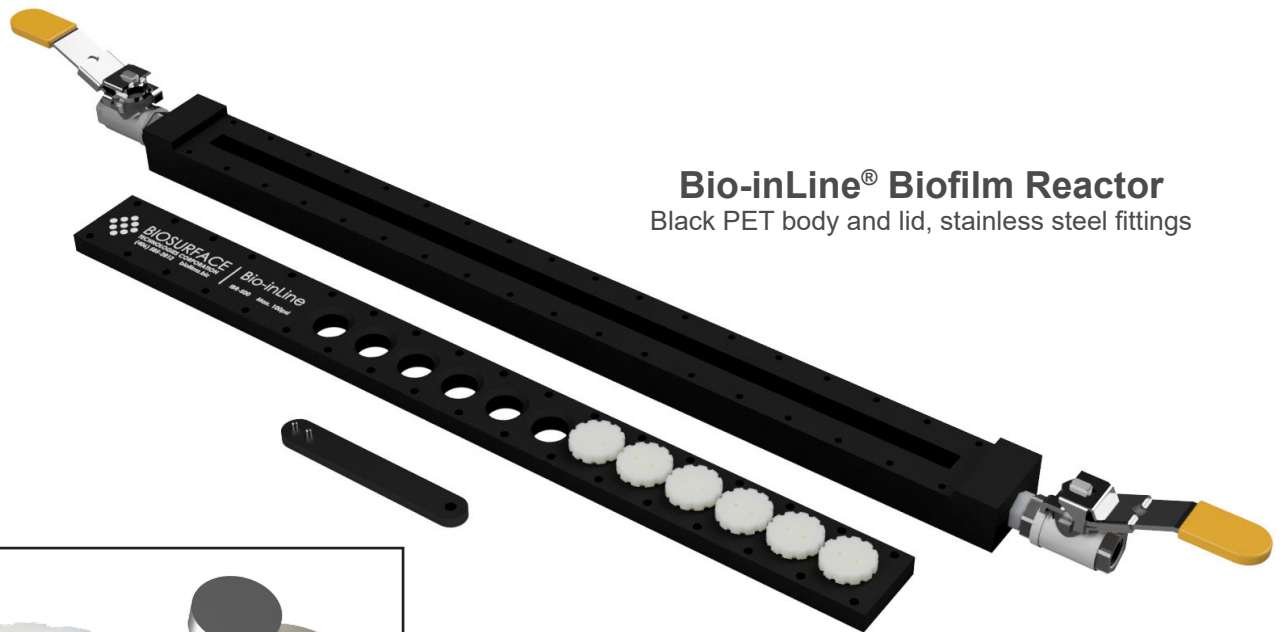
Bio-inLine® Biofilm Reactor Black PET body and lid, stainless steel fittings

The Bio-inLine® Biofilm Reactor was designed to allow the growth and testing of biofilms grown under conditions found in common water distribution systems. They can be easily placed in water piping systems, allowing biofilm testing as needed within the system. This reactor was designed with the original modified Robbins Device (mRD) in mind, but with modifications to improve ease of sampling.