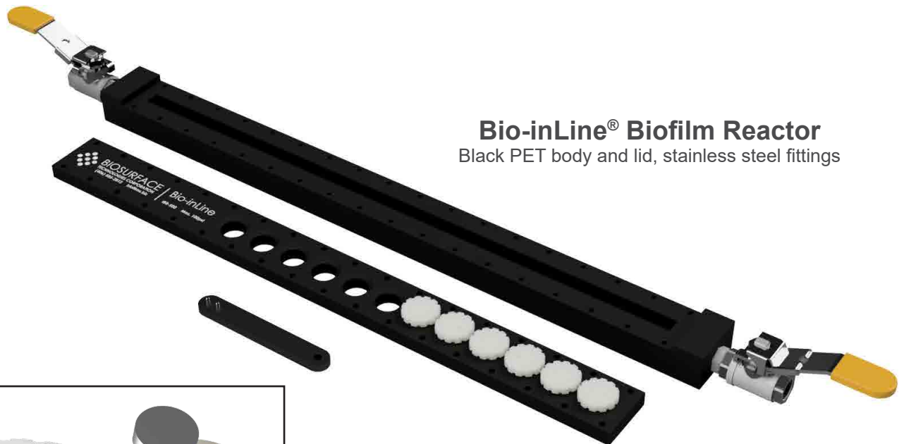
Bio-inLine® Biofilm Reactor Black PET body and lid, stainless steel fittings

The Bio-inLine® Biofilm Reactor was designed to allow the growth and testing of biofilms grown under conditions found in common water distribution systems. They can be easily placed in water piping systems, allowing biofilm testing as needed within the system. This reactor was designed with the original modified Robbins Device (mRD) in mind, but with modifications to improve ease of sampling.