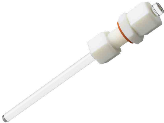
CBR 1969 BF Glass Pivot Rod and Bulkhead fitting with gasket $27.00