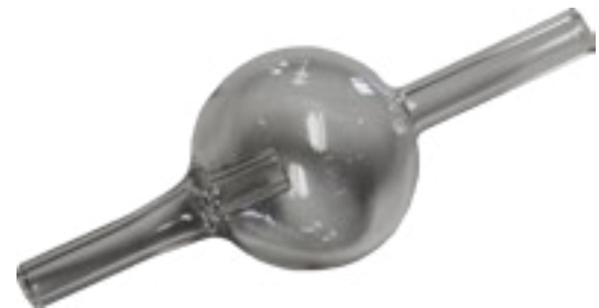
FB 50 Glass Flow Break $40.00