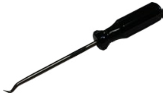
DFR 3842 Coupon Removal Tool $12.00

*Pricing shown is for domestic US Market. Please Contact BioSurface Technologies Corporation, or one of our international distributors for international pricing. International customers will incur additional charges associated with shipping, insurance, import duties, taxes, and fees that are not covered by BioSurface Technologies Corporation.