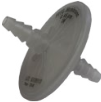
CBR 02915 Bacterial Vent Filter (0.45 um) $18.00