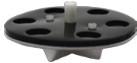
DK A204 Rotating Disk $340.00