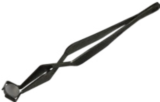
CBR 2210 Coupon Manipulation Tool-Stainless Steel Coupon Tweezer $60.00