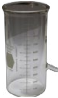
RD 130 Side-arm Flask $108.00