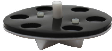
DK A204 Rotating Disk $320.00