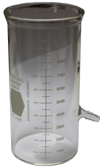
RD 130 Side-arm Flask $99.00