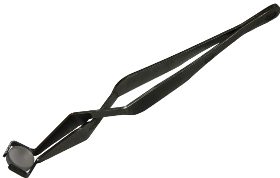
CBR 2210 Coupon Manipulation Tool-Stainless Steel Coupon Tweezer $58.00