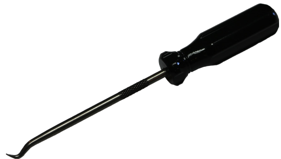
DFR 3842 Coupon Removal Tool $8.00

*Pricing shown is for domestic US Market. Please Contact BioSurface Technologies Corporation, or one of our international distributors for international pricing. International customers will incur additional charges associated with shipping, insurance, import duties, taxes, and fees that are not covered by BioSurface Technologies Corporation.