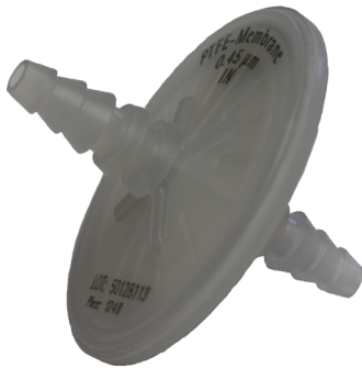
CBR 02915 Bacterial Vent Filter (0.45 um) $16.00