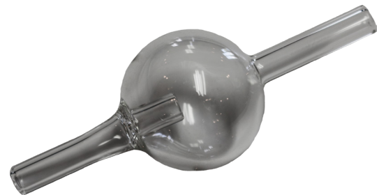
FB 50 Glass Flow Break $36.00