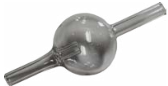
FB 50 Glass Flow Break $40.00