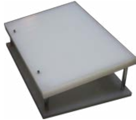
DFR 1106-BS 6-Channel Reactor Support Stand