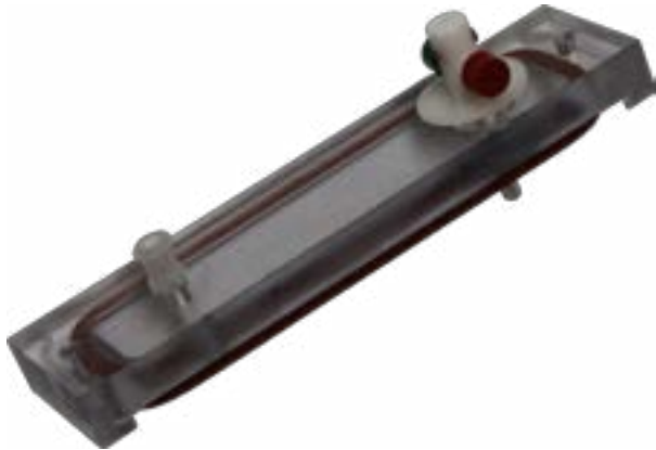
DFR 2-233 Silicone Lid O-ring $5.00