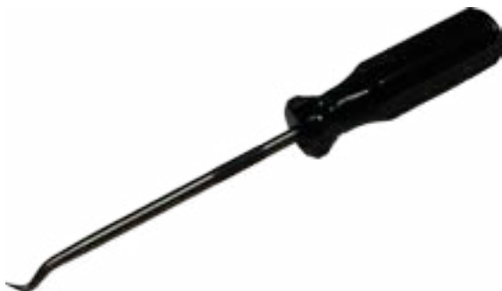
DFR 3842 Slide Removal Tool $12.00