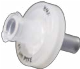
DFR 09740 0.45 um vent filter (each) $12.00