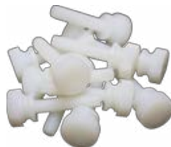
DFR 94323 Lid Thumbscrew $1.50